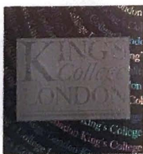
Chairman of Council